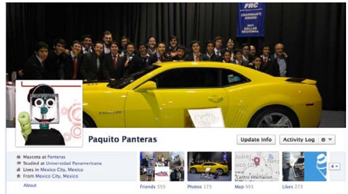
Above: Paquito’s Facebook Wall as of February 28 th , 2013.

The Panteras team has two Facebook accounts; the first one is the profile of Paquito Panteras, team’s mascot, and the other is our fan page. With Facebook we communicate with other teams in a group called “FRC Mexican Teams” were our members help other students with different questions, issues and concerns they might have. The email is an important tool for answering questions and helping others, too. We also use Instagram and YouTube for special content.