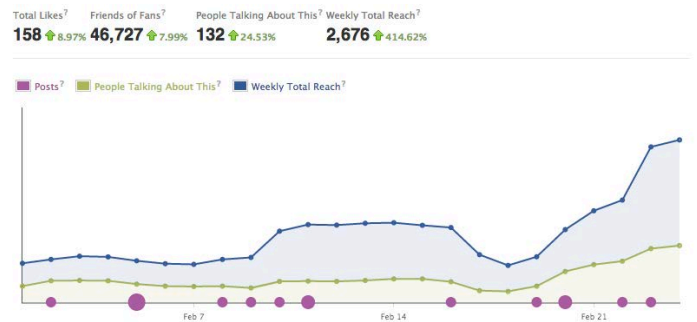
Below: Panteras Facebook fan page stats – February, 2013.

Panteras – http://www.facebook.com/panterasmx